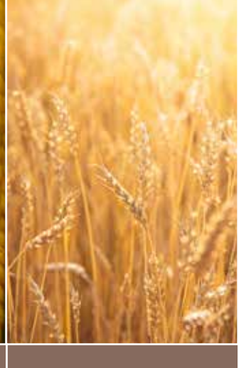
Powdery mildew resistance