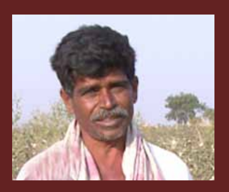
Prabhu Andhra Pradesh, India

When we used non-Bt cotton seeds we did not get much yield. By using Bt cotton on my five acre land, I can get yields of 8 quintals (800 kg) per acre. We used so much insecticides before but now life is fine.