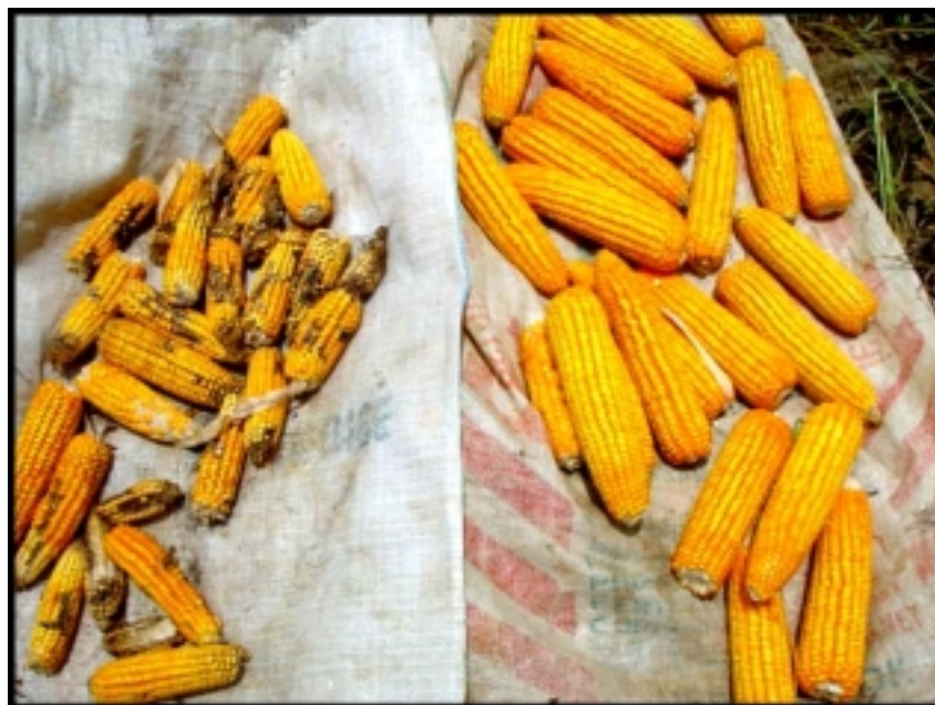
Control of Asian Corn Borer in Bt Maize