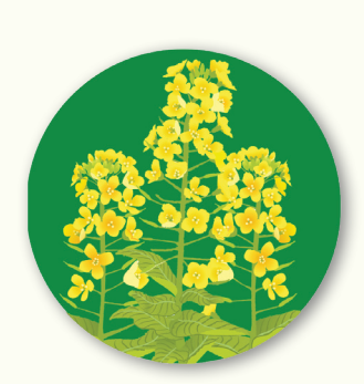
CANOLA grown in 4 countries 30% of global planting