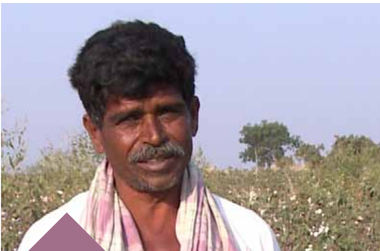
Prabhu Andhra Pradesh, India

In 2005, when glyphosate tolerant corn was introduced in the Philippines, dialogues with farmers in Iloilo were conducted to convert our grasslands into corn farms. With farmers convinced to adopt the biotech crop, technology transfer initiatives took place. The adoption of biotech corn was able to uplift our lives as farmers. This gave us an income of roughly Php30,000 (US$750) per hectare which is far higher than income derived from conventional corn. Also, we no longer need to plow and weed, hence, we have more time to find other means of livelihood. Because of higher income, we can now afford to buy appliances, renovate our houses from nipa hut to concrete shelters, and acquire service vehicles such as motorcycles or even a truck. We can also send our children to school and we can even invest in post harvest equipment.